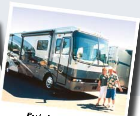
Ready for new adventures in the brand-new Endeavor!